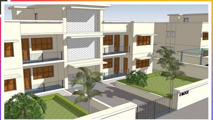
PROPOSED FUPRE VC'S LODGE