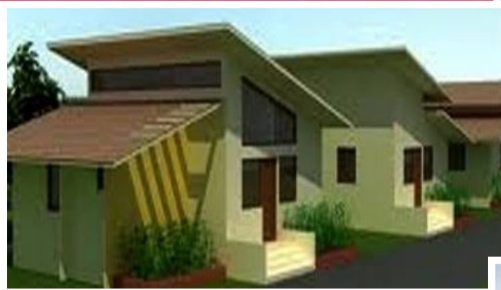
PROPOSED FUPRE DOCTORS & NURSES LODGE