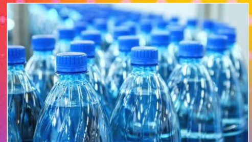
PROPOSED FUPRE TABLE WATER/ BAKERY