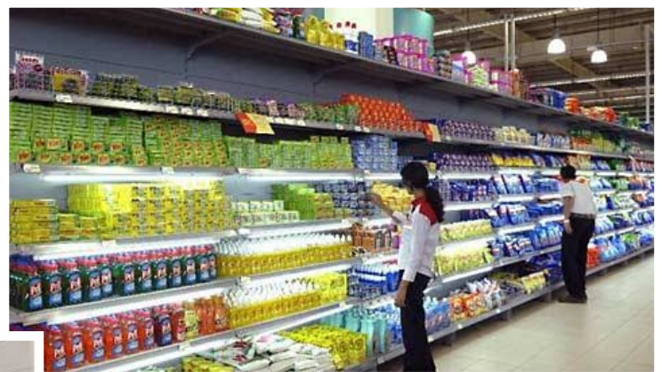
PROPOSED FUPRE SUPERMARKET & MALL