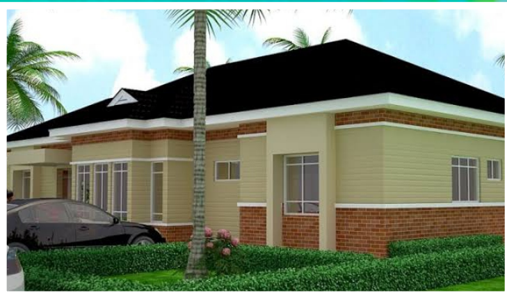
PROPOSED FUPRE BURSAR'S LODGE