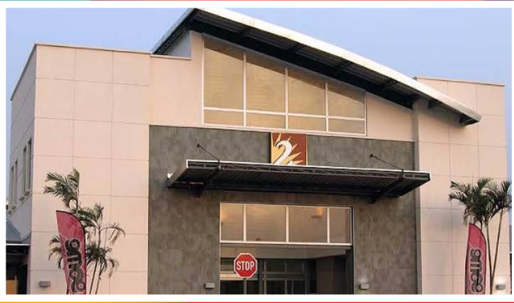
PROPOSED FUPRE PHARMACY