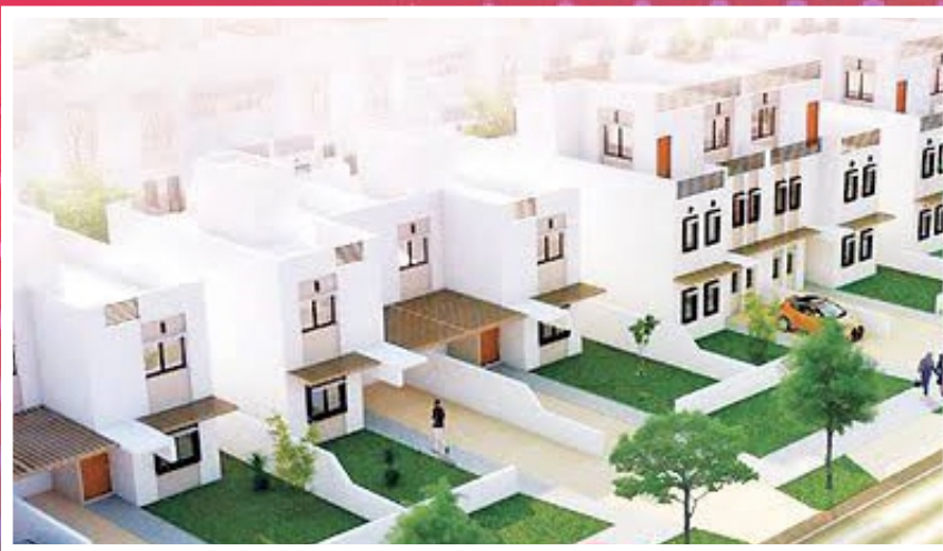
PROPOSED FUPRE SENIOR STAFF QUARTERS