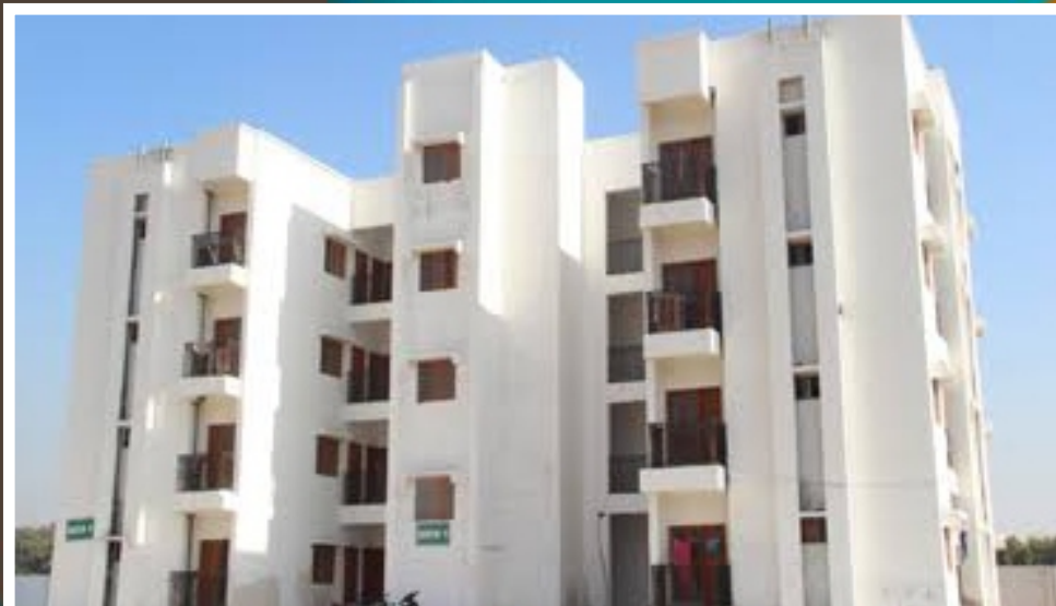
PROPOSED FUPRE SENATE BUILDING