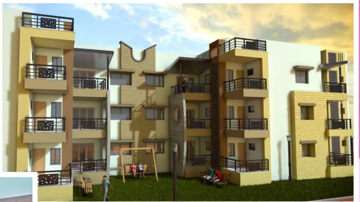
PROPOSED FUPRE INT'L STUDENTS HOSTEL