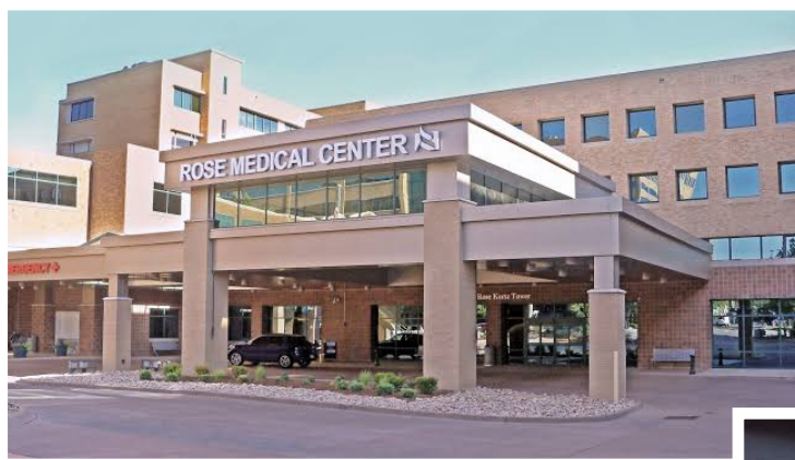
PROPOSED FUPRE MEDICAL CENTRE