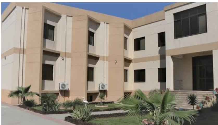
PROPOSED FUPRE REGISTRAR'S LODGE