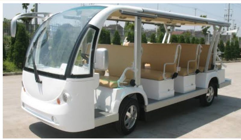
PROPOSED FUPRE CAMPUS SHUTTLE BUS