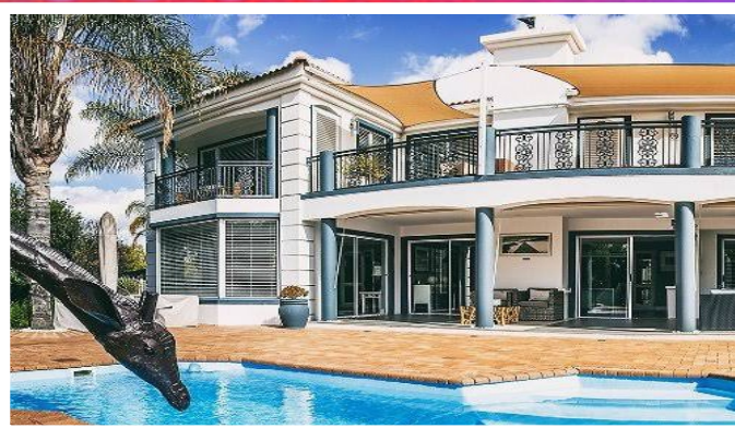
PROPOSED FUPRE INTERNATIONAL GUEST HOUSE & CONFERENCE CENTRE