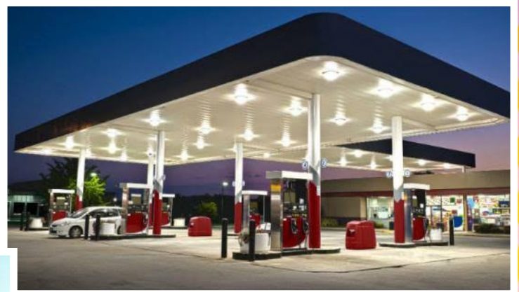
PROPOSED FUPRE GAS & PETROL STATION