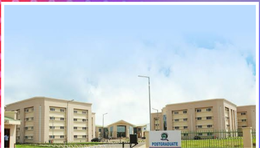
PROPOSED FUPRE PROFESSORS LODGE