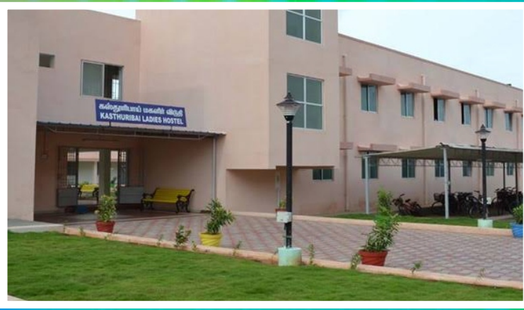
PROPOSED FUPRE MALE/FEMALE HOSTEL