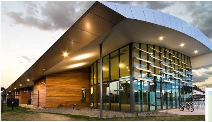
PROPOSED FUPRE LEISURE GARDENS